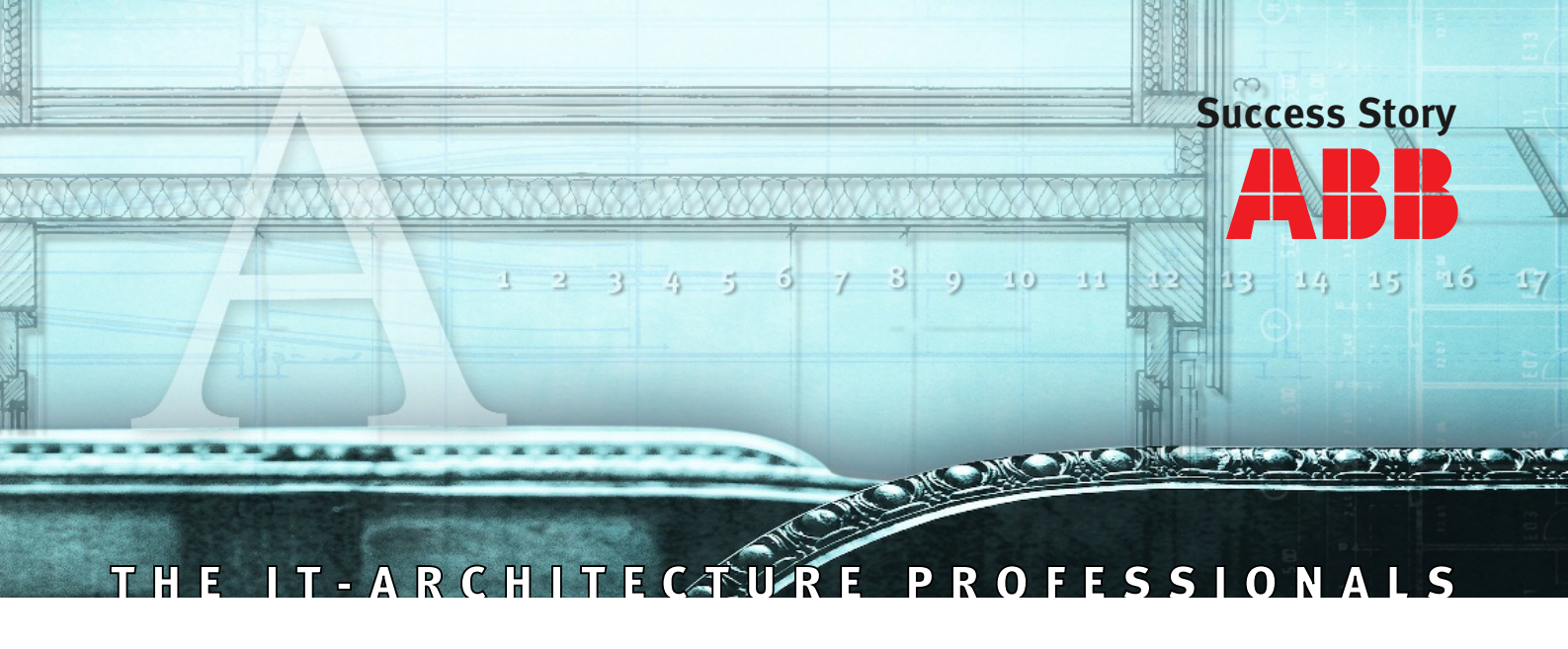
ABB Uses ArcStyler to Web-Enable High-End Resources for Cost-Effective Access via the Intranet